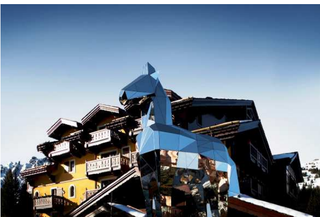
Le Cheval Blanc

To date, France has awarded Palace status to just 13 hotels, of which Courchevel has two. These are the Airelles and the Cheval Blanc, located in the exclusive tree lined Jardin Alpin area of Courchevel.